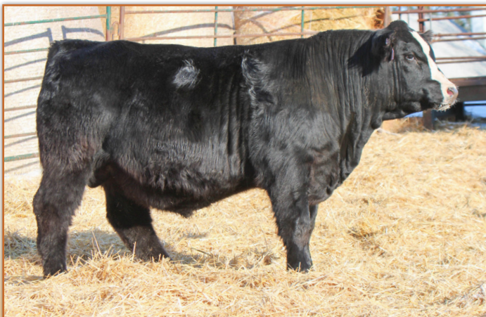
LOT 31 • TT JU JU 855J