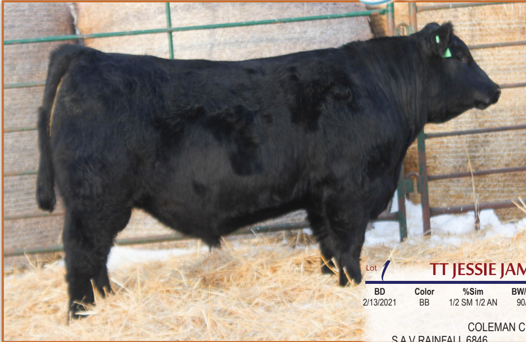
LOT 1 • TT JESSIE JAMES 647J

Here is a Rainfall that combines it all. A moderate framed bull with all the performance needed in a herd bull. Jessie James displays a tremendous amount of muscle from end to end, along with great volume and capacity. He indexed a 108 for weaning weight and will be one of top yearling weight bulls.