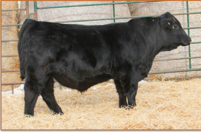
LOT 21 • TT JACKSON 428J