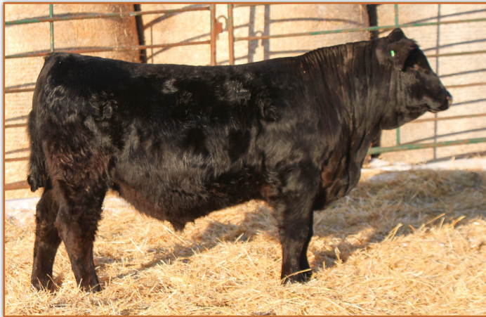
LOT 11 • TT JACK OF ALL TRADES

TJ Gold was high selling bull in Triangle J's 2020 sale and was our pick to sample of the Eagle sons from that year. The Gold's have been very impressive and accepted from the early results of offspring sold. They are moderate framed and big middle with tons of mass and muscle.