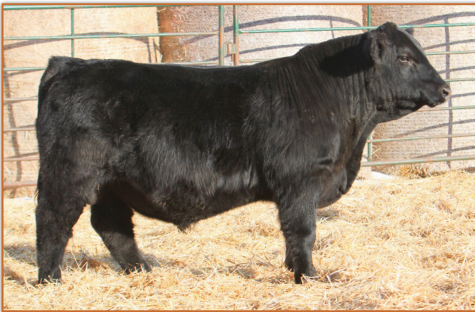
LOT 17 • TT JIMMY MACK 871J