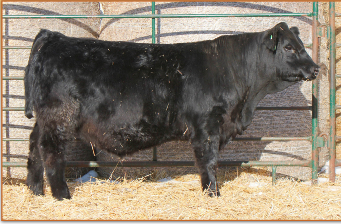
LOT 9 • TT JETTI 633J