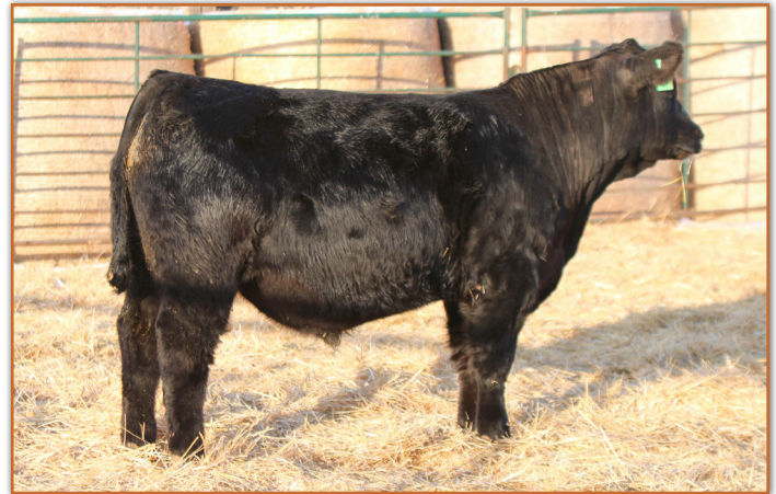
LOT 12 • TT JAKE 999J