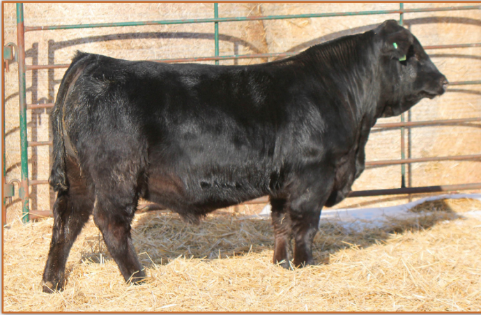
LOT 16 • TT JAMISON 892J

Looking for a homo polled and black heifer bull, here is an excellent candidate. He had an actual birth weight of 77 and posted a 719-weaning weight with an index of 102. He ranks in the top 3% for calving ease and top 5% for birth weight.