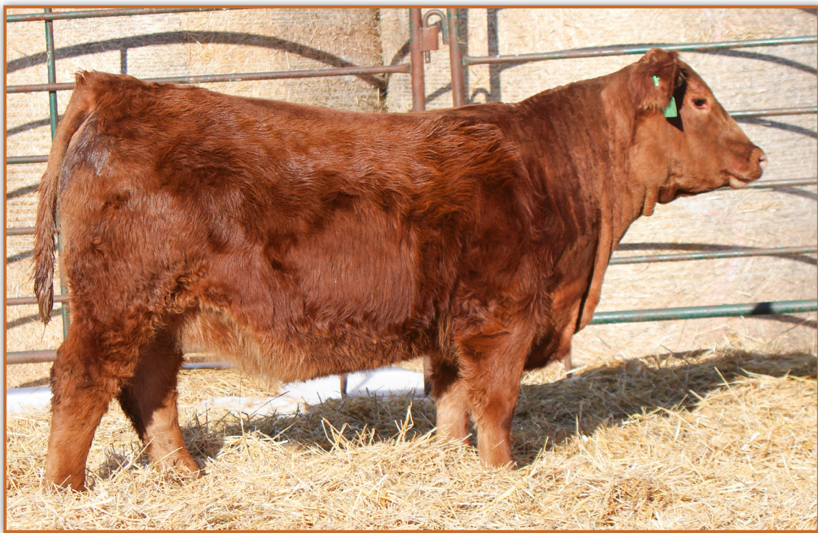
LOT 63 • TT MS FIREBALL 148J

TJ Franchise out of a Cooper. Sweet looking very appealing heifer here. Keep an eye on her sale day.