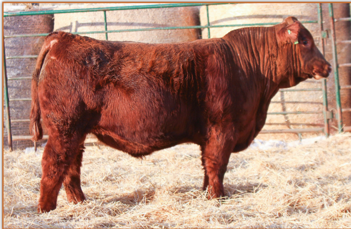
LOT 39 • TT JOCK 593J

TT Elite was one of our top selling bulls in 2018. We collected and sampled him within our herd. We are extremely satisfied with his success. He sired very functional cattle with great volume, mass, and growth. We are excited to see how his daughters will do as well.