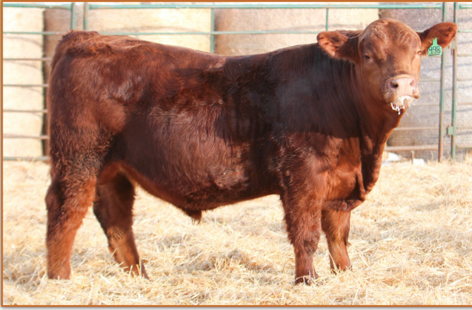
LOT 38 • TT JUMBO 498J