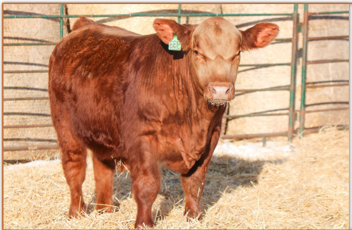
LOT 48 • TT JUDSON 933J

A whole new deal here. The sire here is a Beacon out of a Tuiton a unique red factor pedigree for sure. 947J dam is a first calf heifer out of Imperial that did a super job. Study this set of numbers. This homo polled heifer bull prospect tallies a 182 API ranking in the top 1% with 91 TI top 10%.