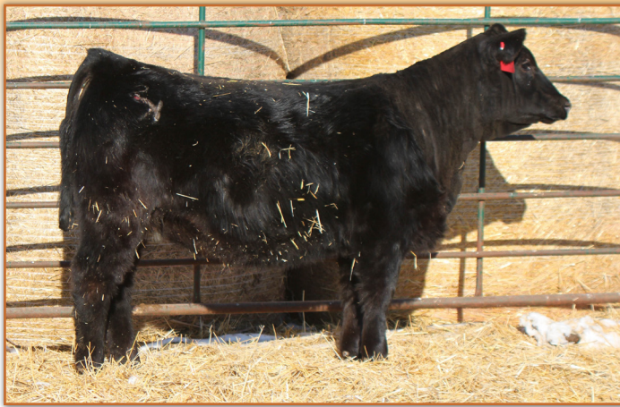
LOT 61 • TT MS FRANCHISE 118J