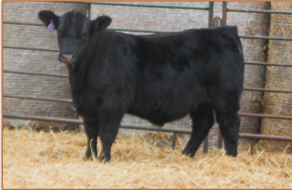
LOT 6 • TT JOE MONTANA 672J

Hook's Eagle has gained popularity each and every year. We were lucky enough to get some semen in 2020. Eagle provides negative birth weight EPD's with top 1% growth EPDs. The Eagle offspring have great value and will add significant profit.