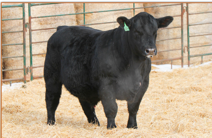
LOT 2 • TT JOHNNY RINGO 688J