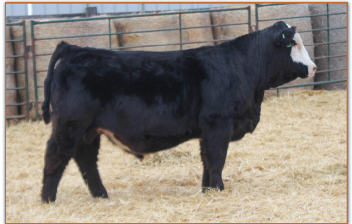
LOT 20 • TT JOHNNY CASH 215J

Here is a ranch favorite from early on. This Cowboy Logic baldie puts it all in one package. Joe Blow is not any average JOE but big, deep, and thick. Check out his numbers, he ranks in the top 15% for WW growth. Tallied an 800 pounds adjusted weight and indexed 113.