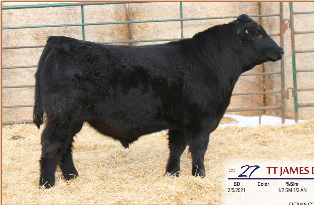
LOT 27 • TT JAMES DEAN 4J

W/C Lockdown is a calving ease sire that will add look, style and dimension to his calves.