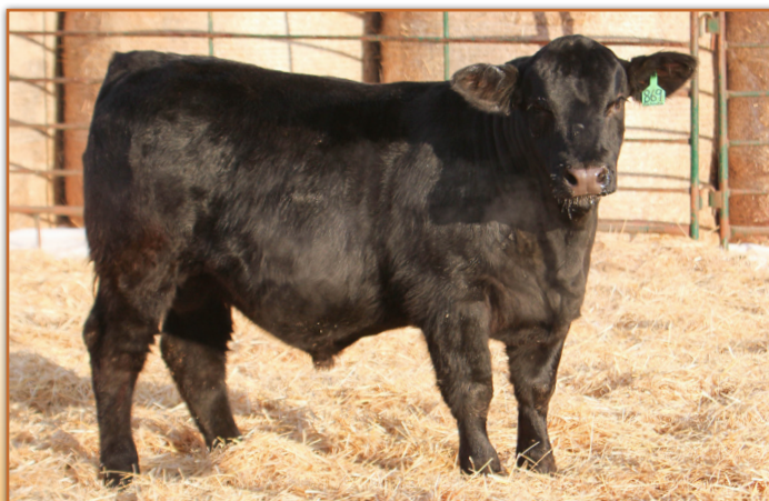
LOT 28 • TT JOURNEY 869J

Eye-appealing progeny exhibit tremendous performance, extra body mass, natural muscle plus great feet and legs. His daughters are attractive-fronted females with excellent volume and are destined to make awesome cows.