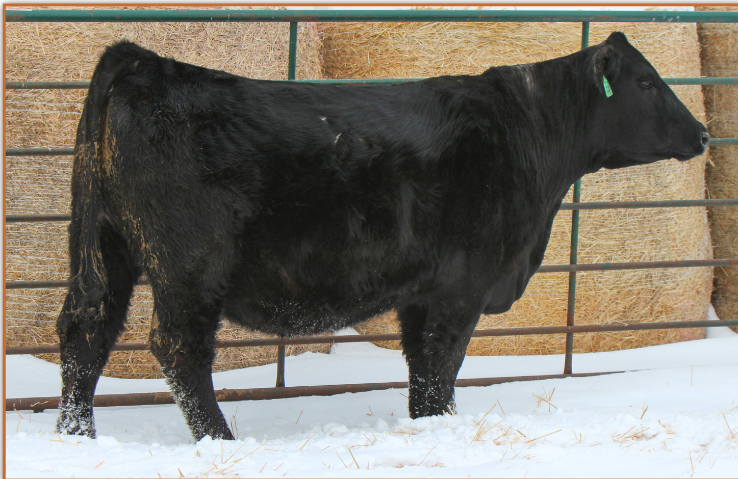
LOT 50 • TT MS PTO 063H

The ELITE 8 is an opportunity to own our best. We again have selected some our top female prospects for you. We will retain the right of one flush on each of these females. We could not let this quality of females go without this opportunity to maintain their genetics. Take some time and analyze these elite females.