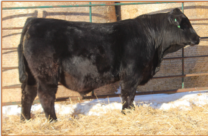
LOT 24 • TT JERRY JEFF 752J

TJ Franchise is a ½ blood sire out of Cowboy Cut that will add body, mass and performance. He is a sire that will improve feet and udder quality in his offspring.