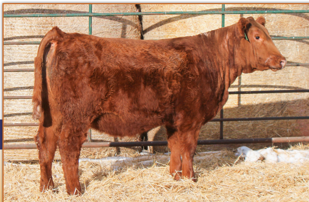
LOT 57 • TT JOY 114J

TT Joy is a high-performance All-American daughter. These All America's are high growth cattle with extra muscle. Look for her to add power and growth.