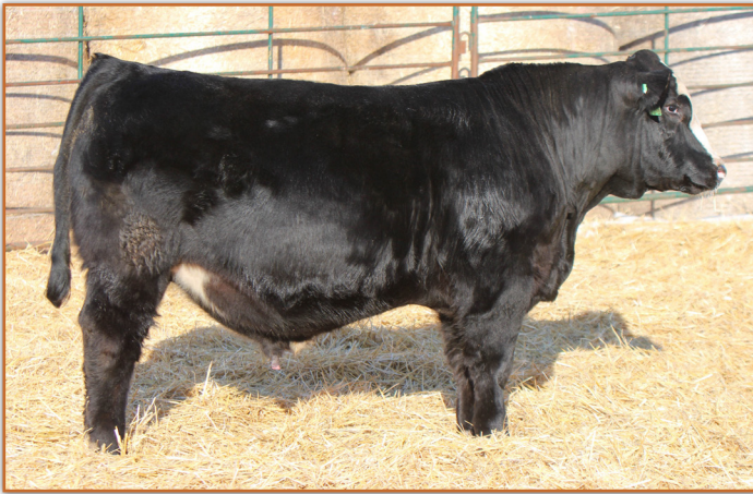
LOT 22 • TT JOE MILLIONAIRE 553J