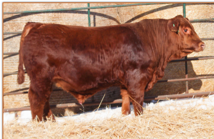
LOT 37 • TT JACK DANIELS 845J