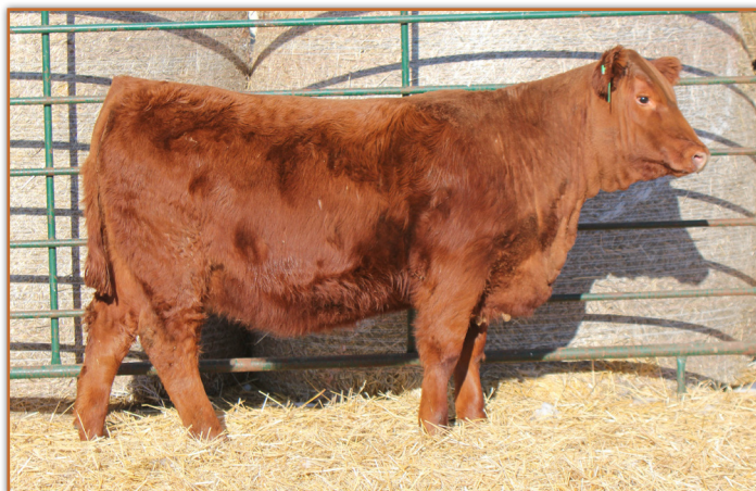
LOT 66 • TT MS FIREBALL 198J