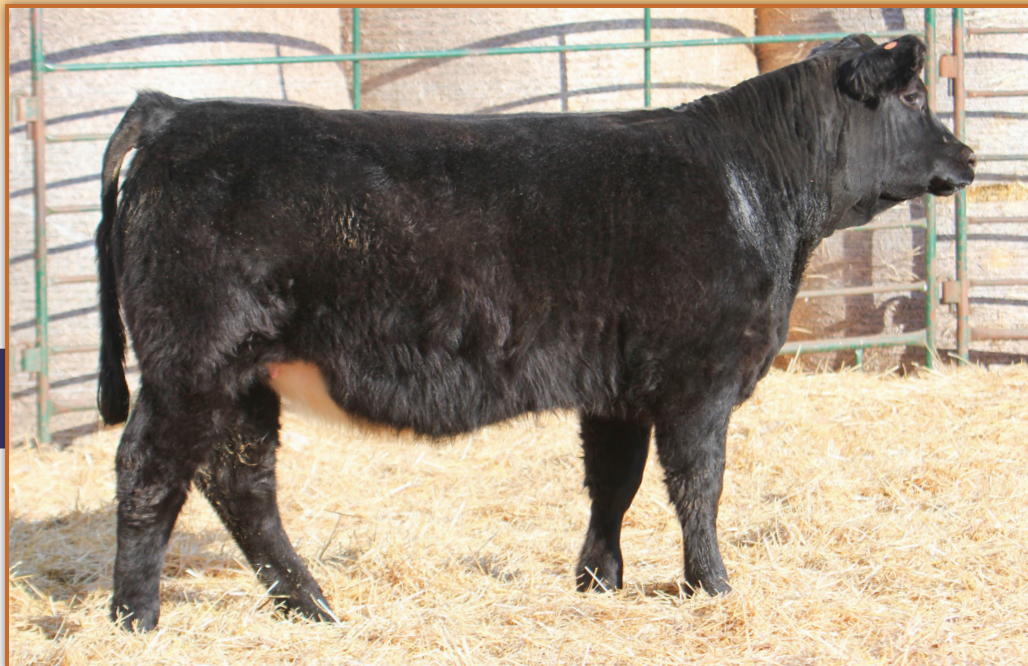
LOT 56 • TT JESSIE 128J