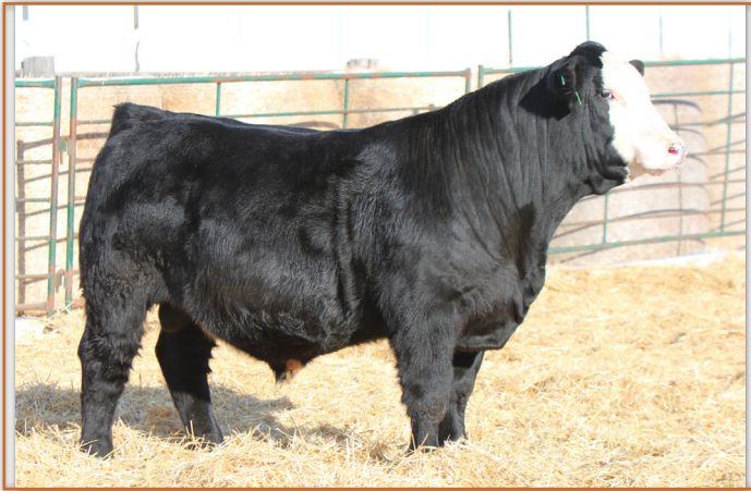
LOT 19 • TT JOE BLOW 318J

SFG Cowboy Logic is another new addition to the sire lineup. We have had continued requests for baldie bulls from customers and decided to try and fill those requests. Logic was our choice as a sire to complete that task. We were excited with the number of baldies, but more importantly have been extremely impressed with the performance of his offspring.