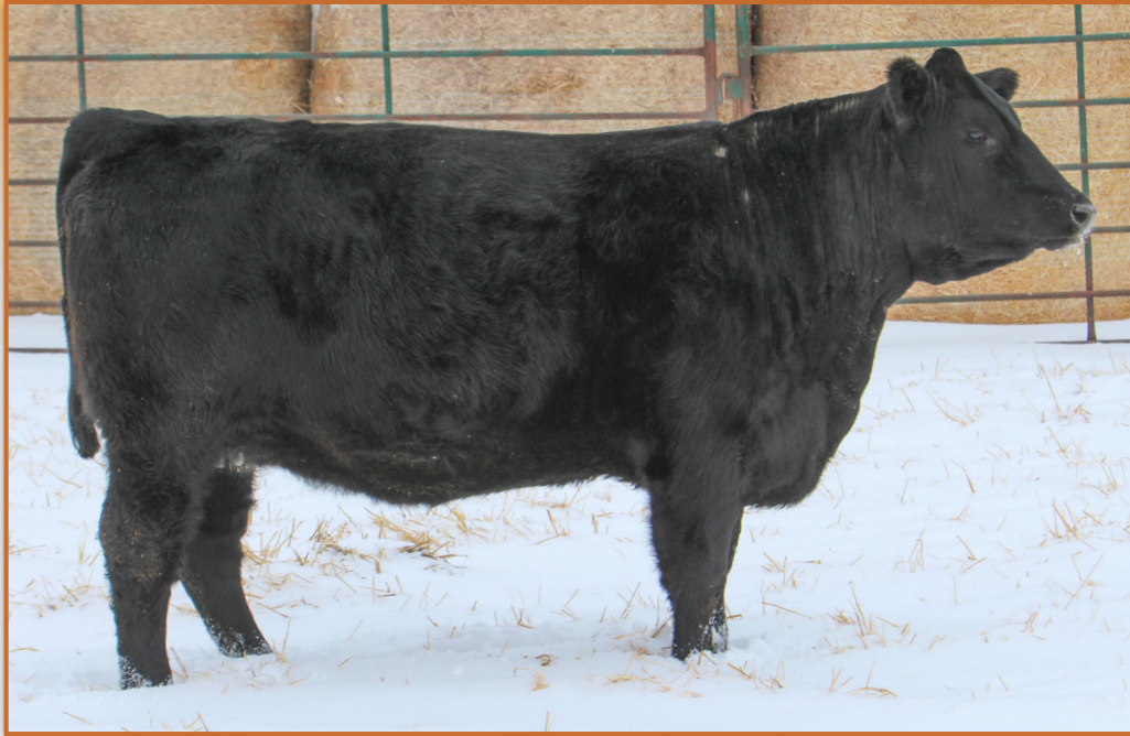
LOT 51 • TT MS TREASURE 051H