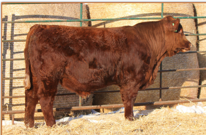
LOT 40 • TT JIMMY 200J