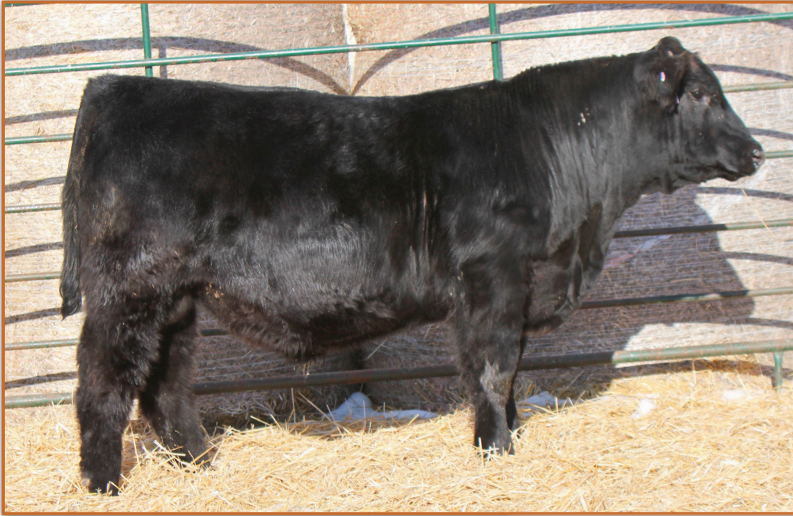
LOT 29 • TT JACK FLASH 723J

SC Pays the Price is the sire of the group of embryos we purchased. We were 3 for 3 on the embryos and all bulls. Lucky for you, these are a great set of sons that will sire some great calves.