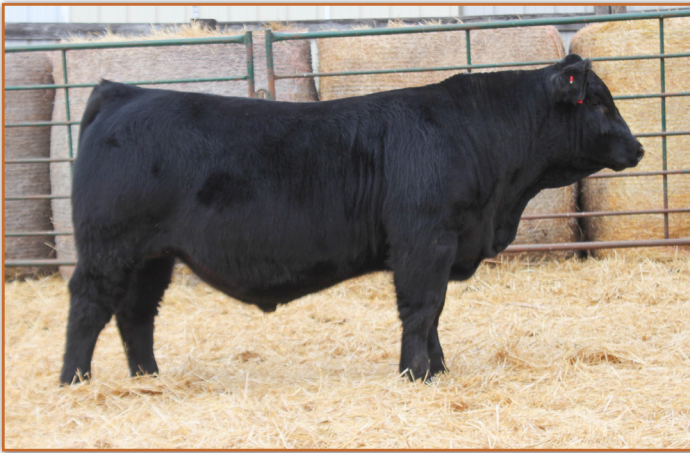
LOT 10 • TT JOHN WAYNE 681J