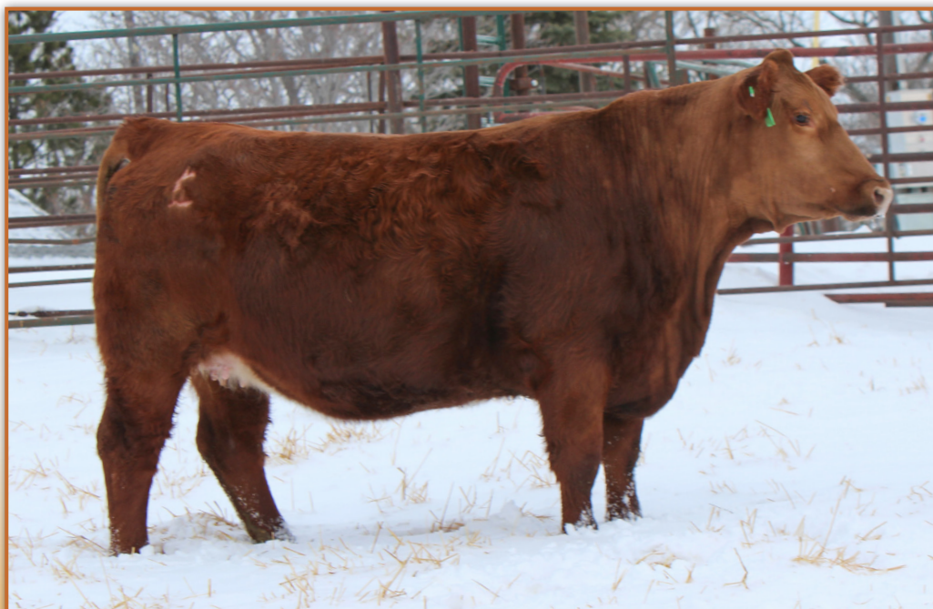
LOT 52 • TT MS RED ZONE 099H

Purebred Red Zone daughter that has that brood cow look. She is big bodied with big top and hip. Pasture bred to GW Hawkeye June 26th.