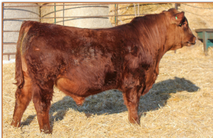
LOT 36 • TT JETHRO 176J

CDI Hometown has been around for a some time now and continues to be the go to bull for extra performance and muscle. We used him on some of our half blood females to make ¾ bloods and maintain a more moderate frame. Hometown certainly adds that extra growth kick and mass.